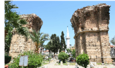
Pillars of Church in Philadelphia Revelation Series